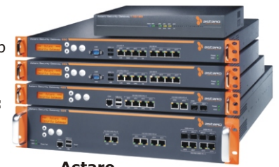
Astaro Hardware Appliances