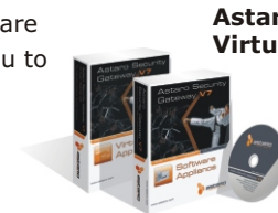
Astaro Software & Virtual Appliances