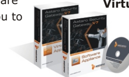
Astaro Software & Virtual Appliances