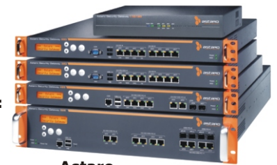
Astaro Hardware Appliances